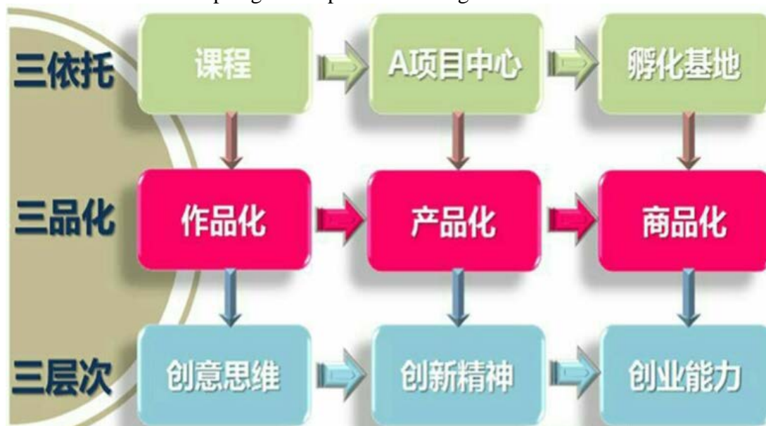
Figure 1 College students' innovative and entrepreneurial teaching objectives

The promotion of education mechanism for innovation and entrepreneurship of university students is conducive to the leapfrog development of talent cultivation model in universities. At present, the scale of education in domestic higher education is increasingly large. However, restricted by many factors, such as the homogeneity of training mode, lack of innovation consciousness, and the incoordination between practice and theory, the key indicators such as school quality and the employment competitiveness of graduates are difficult to be improved in quality. The new era puts forward new requirements for talents. The promotion of the education mechanism for innovation and entrepreneurship of college students can promote the transformation of education concept, in-depth promotion of education reform, and innovative talent cultivation mode, so as to cultivate high-quality talents for economic transformation and social development, and realize sustainable and leapfrog development of colleges and universities in talent cultivation [3] .